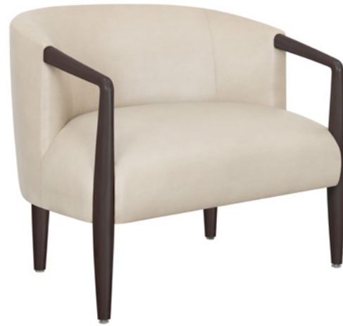
Model: MTDB10 35W 27D 31H 30SW 20SD 19SH 25AH

Kwalu's Montedoro Bariatric chair is plush, angular, strong and inviting. The angled arms form the cylinder front legs which frame the sumptuous seat cushion. Optional piping is available along the back of the chair and on the seat base. The striking Montedoro Bariatric is rated to 525lbs weight capacity and is easily integrated into any common area setting.