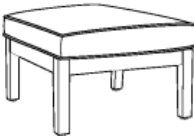
P With Piping