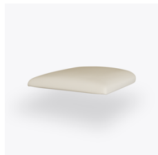
Seat Cushion is Field Replaceable

The seat cushion can be replaced in the field.