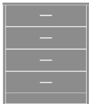
Atlanta Chest Wide, 4 Drawers Model: ATCH40W 31.75W 18.5D 37H