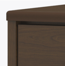
Waterfall Edging on Top

The kit and instructions for wall mounting are included with this product. The wall mount instructions provided must be followed carefully for a secure, durable, and long-lasting solution to ensure the safety of the unit and the user.