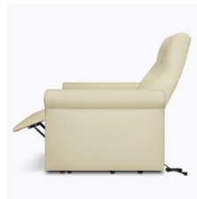
Three Position Recliner

Concealed cleanout eliminates a debris build-up behind the seat cushion.