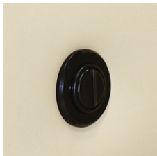
2 Button Control

Power recline with full-lift capability is activated by a 2 button control.