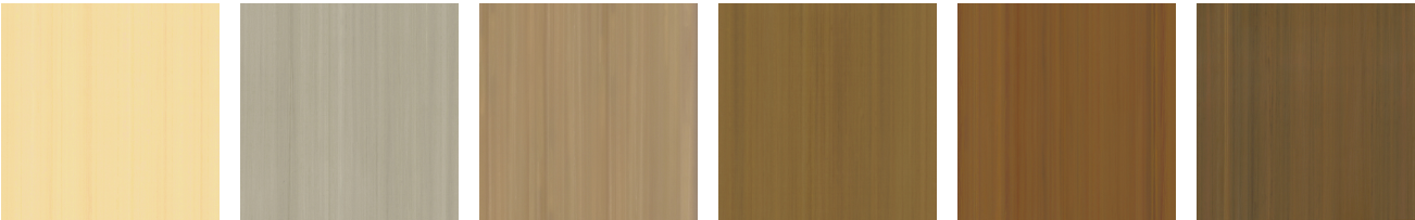
Sugar Maple Weathered Teak Northern Oak Vintage Teak Patagonian Cherry Northern Walnut