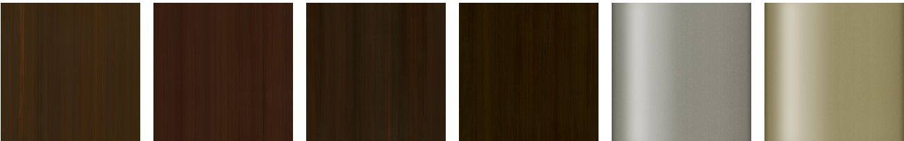
Espresso Natural Mahogany Midnight Oak Blackwood Premium Platinum Premium Soft Gold