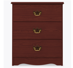
Other Chest Styles

Beaufort chest styles include 3,4, 5 and 6 drawer versions.