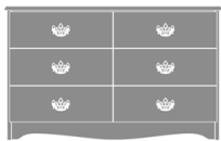
Beaufort Dresser, 6 Drawers Model: BEDR60 48.25W 19D 30H