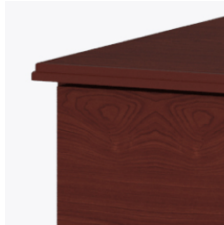
OG Edging on Top

The kit and instructions for wall mounting are included with this product. The wall mount instructions provided must be followed carefully for a secure, durable, and long-lasting solution to ensure the safety of the unit and the user.