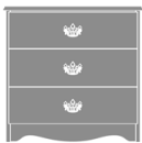
Beaufort Chest Wide, 3 Drawers Model: BECH30W 31.5W 19D 30H