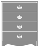
Beaufort Chest Wide, 4 Drawers Model: BECH40W 31.5W 19D 36H