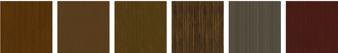
English Chestnut Northern Walnut American Walnut Golden Ebony Silver Ash African Mahogany