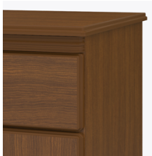
OG Edging Finish

The kit and instructions for wall mounting are included with this product. The wall mount instructions provided must be followed carefully for a secure, durable, and long-lasting solution to ensure the safety of the unit and the user.