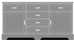
Dorchester Credenza Station – 60”W Model: DOBF62S60 60W 18D 32H