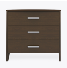
Optional Wider Version

Are constructed with both dowel and mechanical fasteners for additional strength. 100lb static and dynamic load Euro Drawer Slides allow for easy opening and closing.