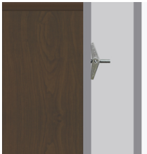
Wall Mount Hardware

Kwalu's proprietary finish doesn't have any of the drawbacks of wood. The finish is moisture impervious, easy to clean and maintenance-free.