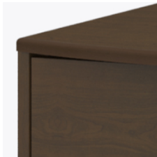
Waterfall Edging on Top

The kit and instructions for wall mounting are included with this product. The wall mount instructions provided must be followed carefully for a secure, durable, and long-lasting solution to ensure the safety of the unit and the user.