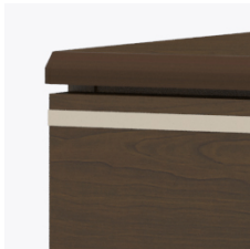
Beveled Edging on Top

The kit and instructions for wall mounting are included with this product. The wall mount instructions provided must be followed carefully for a secure, durable, and long-lasting solution to ensure the safety of the unit and the user.