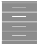
Hollywood Chest Wide, 4 Drawers Model: HLCH40W 31.5W 19D 36H