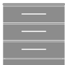
Hollywood Chest Wide, 3 Drawers Model: HLCH30W 31.5W 19D 30H