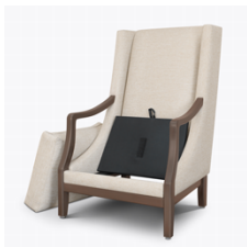
Removable Seat Deck

Removable seat deck prevents buildup of debris and provides for easy maintenance.