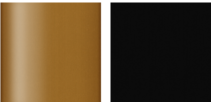
Premium Pure Copper Premium Black Copper