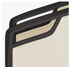
Cut Out Arm Detail

Distinctive arm cut out detail allows for easy handling of the chair.