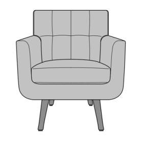
Monserrato Lounge Chair, without Button Detail, without Seat Rail Model: MSRR121 29W 28.75D 33H 25AH