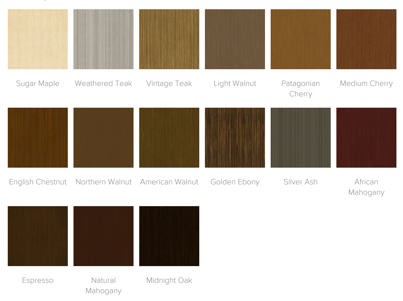
Table Base Finish