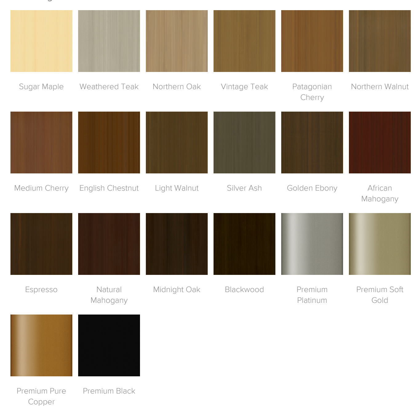
Table Leg Finish