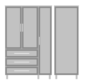
Tempe Armoire Wardrobe, 3 Drawers, 3 Doors, Right-Hinged Model: TEAW33R 45.5W 23.25D 71H