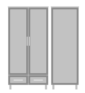
Tempe Alzheimers Double Wardrobe, 2 Drawers, 2 Doors Model: TEALZ 34.5W 23.25D 71H