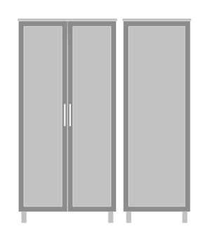
Tempe Double Wardrobe, No Drawers, 2 Doors Model: TEWR02 34.5W 23.25D 71H