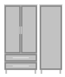
Tempe Double Wardrobe, 2 Drawers, 2 Doors Model: TEWR22 34.5W 23.25D 71H