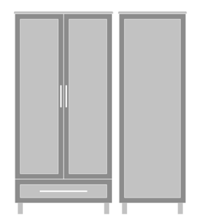
Tempe Double Wardrobe, 1 Drawer, 2 Doors Model: TEWR12 34.5W 23.25D 71H