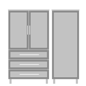
Doors Model: TEAM32