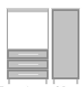
Tempe Armoire, 3 Drawers, No Doors Model: TEAM30 35.5W 23.25D 63.5H