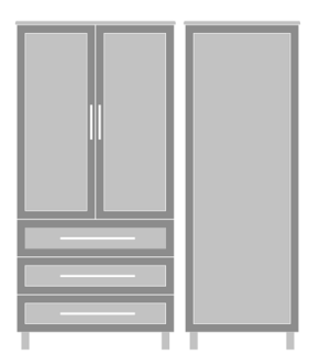
Tempe TV Armoire with DVD Shelf, 3 Drawers, 2 Doors Model: TEAMTV32 35.5W 25.25D 72.25H