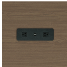
Table ships fully assembled.