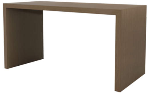
Model: LECOTBLB8436A 84W 36D 42H

The Lecco tables are completely constructed of easily cleaned and maintained Kwalu laminate material on steel reinforced frames. Lecco is available in multiple sizes and two heights, bar and counter height. An optional power grommet is centered on the tabletop and accommodates 2 power outlets and 2 USB ports. A magnetically attached panel is removable to access wires.