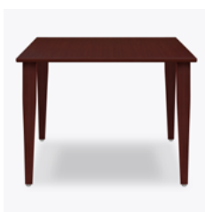
Table height can be adjusted to accommodate wheelchairs and is optional.