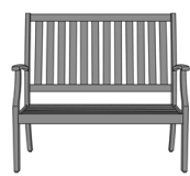
Arezzo Bench No Cushions Moasdfadel: AREBNC 47W 24.5D 40H 26AH