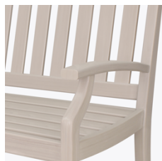
Waterproof Outdoor UV Protected Frame

Special additive protects frame against the elements and damaging ultraviolet rays.