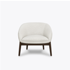
Number of Seats

Concealed cleanout eliminates a debris build-up behind the seat cushion.