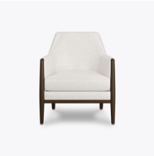
Number of Seats

Our patented steel-reinforced joint system uses over 20 pieces of steel in most Kwalu chairs. Stop ongoing and costly furniture replacement.