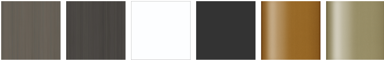
Graphite Walnut (Protea™)