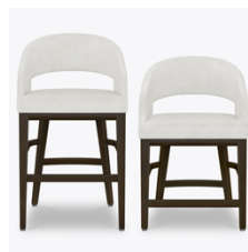
Bar and Counter Height

Back Cutout prevents build-up of debris and provides for easy maintenance.