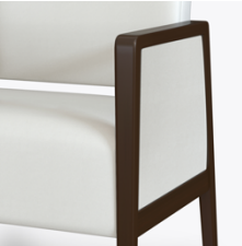
Optional Closed Arm Panels

Choose from 3 seat styles – lounge chair, love seat, and sofa.