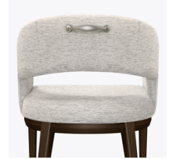
Optional Back Handle

Optional casters available on front legs only.