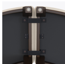
Optional Ganging Brackets

The bench can be grouped or ganged with others to create a circle or wave-like effect in lobbies and other waiting spaces.