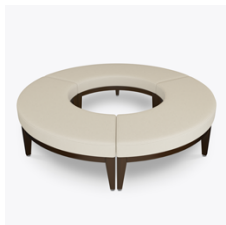
Coordinates with other Benches

Our patented steel-reinforced joint system uses over 20 pieces of steel in most Kwalu chairs. Stop ongoing and costly furniture replacement.