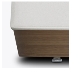
Tapered Plinth Base

Kwalu's proprietary finish doesn't have any of the drawbacks of wood. The finish is moisture impervious, easy to clean and maintenance-free.