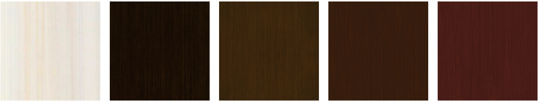
Wood Ash (Fusion)