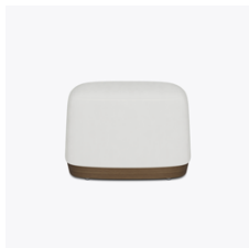
Available as Ottoman

The base of the Minori Bench and Ottoman is a unique tapered plinth design.