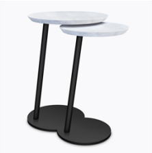
Coordinates with Cantilever Nesting - Large Table

Corian®/ Hanex®/ Krion® tops, 1" elliptical edged, are available on all occasional tables in the collection.