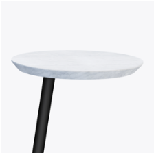
Corian®/ Hanex®/ Krion® Top

Table features a 1" solid surface top with elliptical edge detailing.