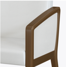
Optional Closed Arm Panels

Both the back cushion and the seat cushion can be replaced in the field.