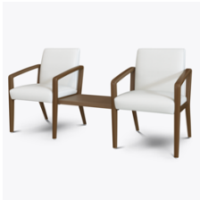
Optional Linking Tables

For increased comfort and support in waiting or reception areas, choose the optional tall back cushion.