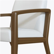
Faceted-Edged Frame Detailing

The outside face of the chair frame showcases faceted-edge detailing reminiscent of hand-crafted wood workmanship.