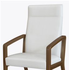
Optional Tall Back Cushion

Available with or without upholstered arm panels.