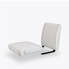
Back Cushion and Seat Cushion are Field Replaceable

Cleanout is incorporated behind the seat cushion to prevent buildup of debris while providing a clean look.