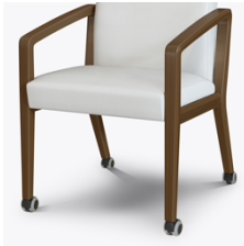
Brake Under Load Casters

Optional Center Linking tables are available to provide stationary space between the chairs and fit your space.