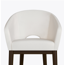
Optional Cutout on Back

An optional cutout on back is available to prevent buildup of debris and provide for easy maintenance.