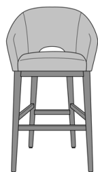
Sciara Bar Stool, with Visible Cleanout Moasdfadel: SCIASTLB21 24W 24.75D 44H 36AH