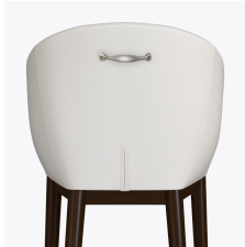
Optional Back Handle

An optional cutout on back is available to prevent buildup of debris and provide for easy maintenance.