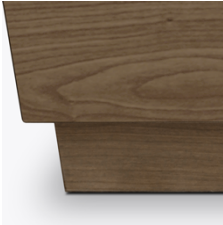
Tapered Plinth Base

A sloped and angled top edge gives a more contemporary look to this collection.