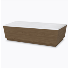
Corian®/ Hanex®/ Krion® Top

The base of this table is a unique tapered plinth design.