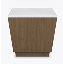
Other Table Styles

Corian®/ Hanex®/ Krion® tops with beveled edging are available for all tables in this collection.