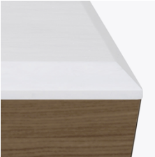
Beveled Edging on Top

Kwalu’s proprietary finish doesn’t have any of the drawbacks of wood. The finish is moisture impervious, easy to clean and maintenance-free.