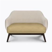
Optional Fabric Zones

Concealed cleanout eliminates a debris build-up behind the seat cushion.