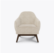
Number of Seats

The selection of varied fabric placement on the seat, back and above the seat rail is optional.