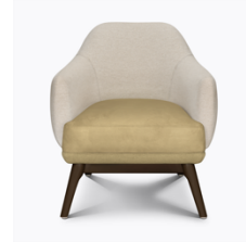
Optional Fabric Zones

Concealed cleanout eliminates a debris build-up behind the seat cushion.