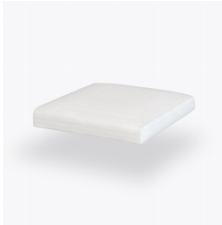
Seat Cushion is Field Replaceable

Choose from 2 optional back styles – Slat Back or Upholstered Back.