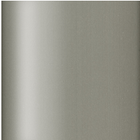
Premium Platinum (Classic)