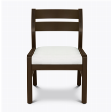
Optional Back Style

Wallsaver back legs help keep walls in pristine condition.