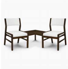
Optional Linking Tables

The seat cushion can be replaced in the field.