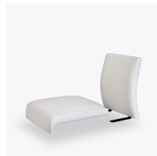
Back Cushion and Seat Cushion are Field Replaceable

Cleanout prevents buildup of debris and provides for easy maintenance.