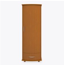
Other Wardrobe Styles

Standard clothing rod may be attached at ADA height of 48” from the floor.