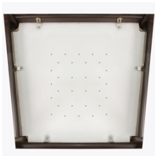
Tamper Proof Seat Protector

Cross-bar underframe; optional concealed floor mounting available.