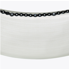
Tamper Proof Staple Cover

Laminate seat bottom with ventilation but no access to internal building materials and loose fabric; no visible staples, tamper-proof screws and brackets.