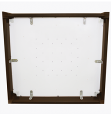
Tamper Proof Seat Protector

Our patented steel-reinforced joint system uses over 20 pieces of steel in most Kwalu chairs. Stop ongoing and costly furniture replacement.