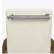
Optional Push Bar

Power recline is activated by pressing the 2 button control on the side of the chair.