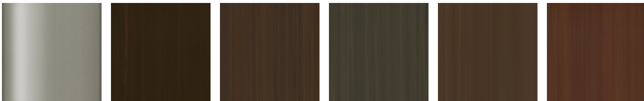
Premium Platinum (Classic) Espresso (Protea™) Golden Ebony (Protea™) Silver Ash (Protea™) Light Walnut (Protea™) Medium Cherry (Protea™)