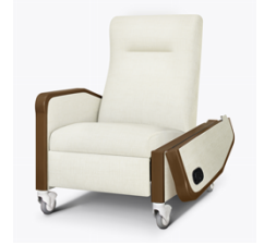
Optional Side Folding Arm

An optional side folding table is available on the right side only.