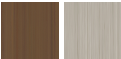
Patagonian Cherry (Protea™) Weathered Teak (Protea™)