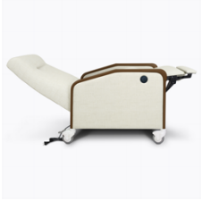
Motorized Trendelenburg Recliner

The Motorized Trendelenburg Recliner fully extends to a depth of 66 inches.