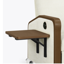
Optional Side Folding Table

Add the optional push bar across the top of the chair back to aid staff in positioning the chair.