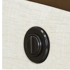
2 Button Control

Concealed cleanout eliminates a debris build-up behind the seat cushion.