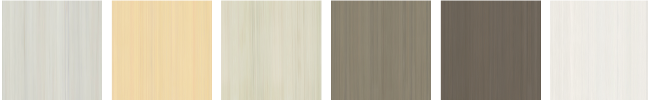
Sand Ash (Protea™) Natural Maple (Protea™) Natural Ash (Protea™) Medium Oak (Protea™) Medium Ash (Protea™) Grey Ash (Protea™)