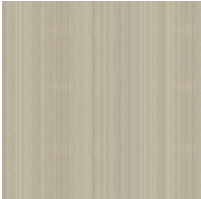
Outdoor Weathered Teak UV (Outdoor)