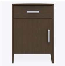
Other Bedside Styles

A top drawer lock is available and is optional.