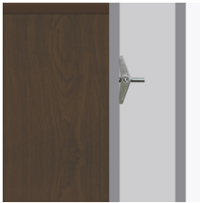
Wall Mount Hardware

Kwalu’s proprietary finish doesn’t have any of the drawbacks of wood. The finish is moisture impervious, easy to clean and maintenance-free.