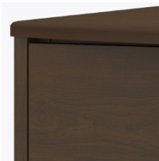
Waterfall Edging on Top

The kit and instructions for wall mounting are included with this product. The wall mount instructions provided must be followed carefully for a secure, durable, and long-lasting solution to ensure the safety of the unit and the user.