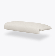
Seat Cushion is Field Replaceable

Cleanout prevents buildup of debris and provides for easy maintenance.