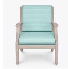
Number of Seats

Piping available on back pillows and seat cushions and is optional.