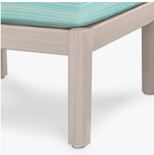
Waterproof Outdoor UV Protected Frame

Special additive protects frame against the elements and damaging ultraviolet rays.