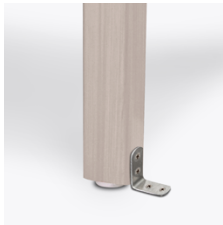
Optional Floor Mounting

Please contact a sales associate to purchase additional or replacement cushions.