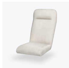
Back Cushion and Seat Cushion are Field Replaceable

Kwalu's exclusive rocking mechanism produces an ultimately satisfying movement.